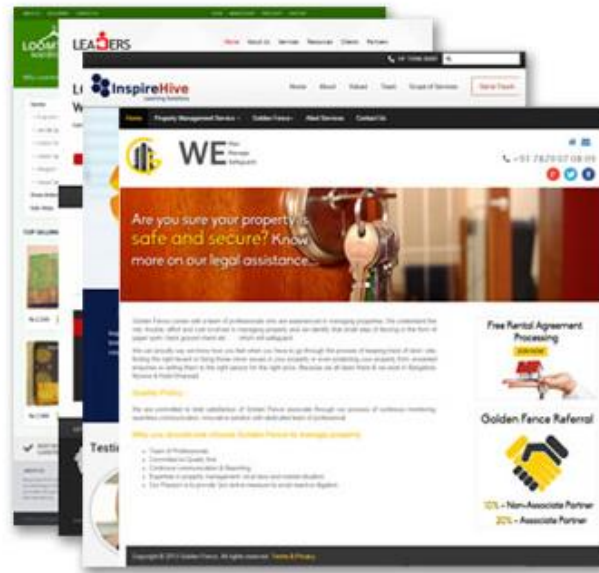
Logo and website designing