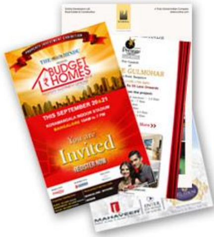
Email marketing Creatives

We design Digital and Print purpose creatives