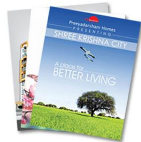
Brochures and collateral designs